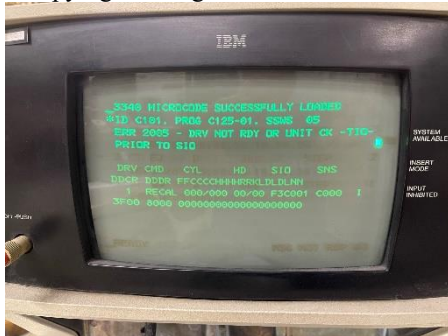
Drive not ready!